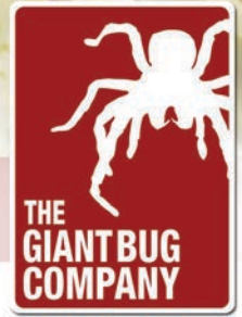
PHOTO OP CATERPILLAR A