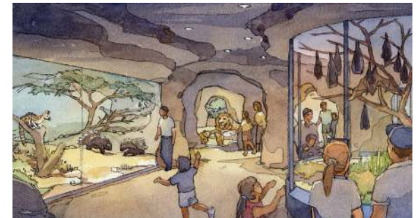
Indoor Mixed Species Habitats