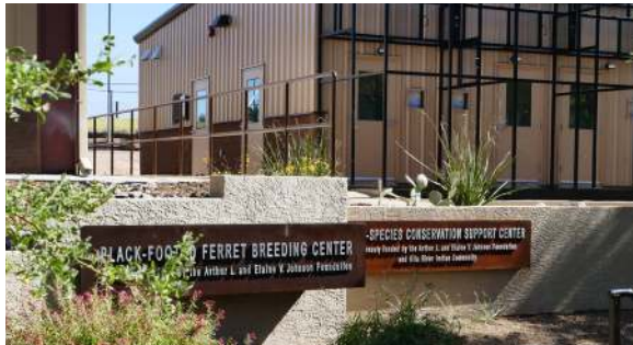
Multi-species Conservation Support Center