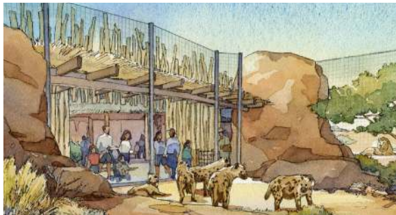
African Lion/Spotted Hyena Habitat