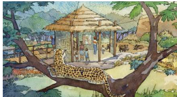
Leopard/Warthog/Mixed Species Habitats