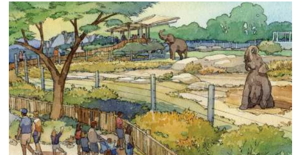
Giants of the Asian Realm presented by The Kemper and Ethel Marley Foundation