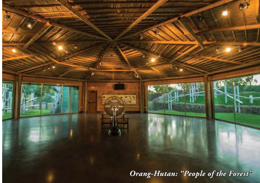
Orang-Hutan: "People of the Forest"