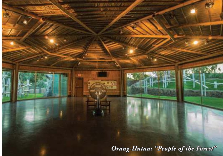
Orang-Hutan: "People of the Forest"