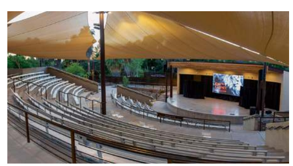
Doornbos Discovery Amphitheater