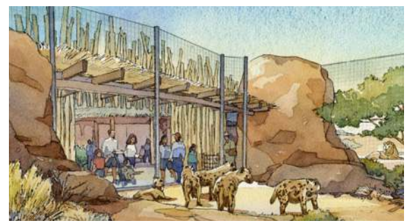
African Lion/Spotted Hyena Habitat