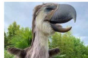
Titanis Terror Bird