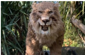
Smilodon Sabertooth Tiger