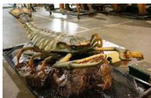
Jaekelopterus Sea Scorpion