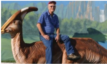
Photo Op Para

Pose for photos on this climbable Parasaurolophus, whose name alludes to the bony crest on its head