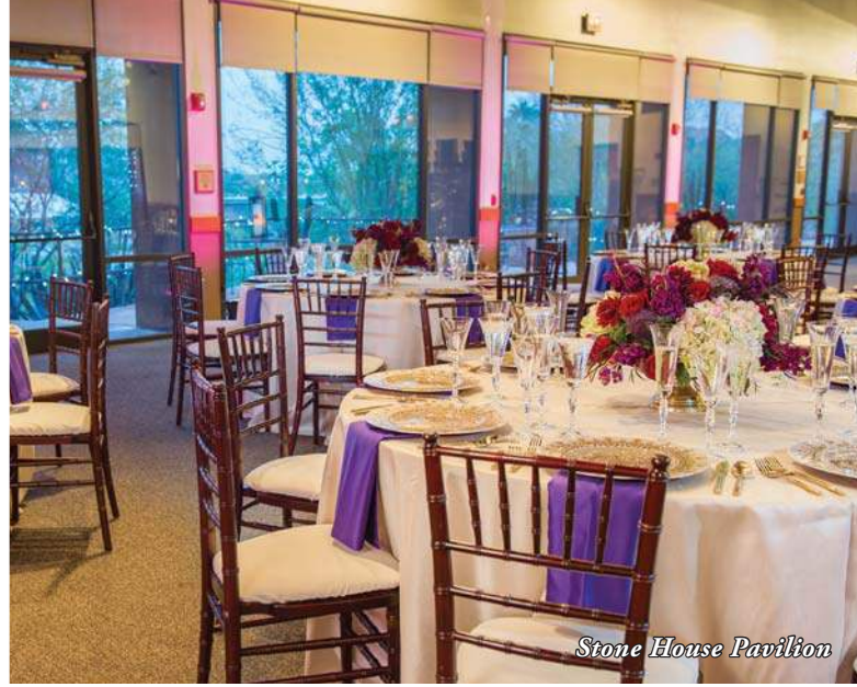
Stone House Pavilion