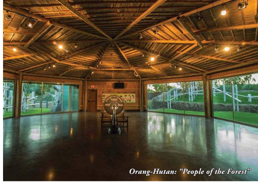
Orang-Hutan: "People of the Forest"