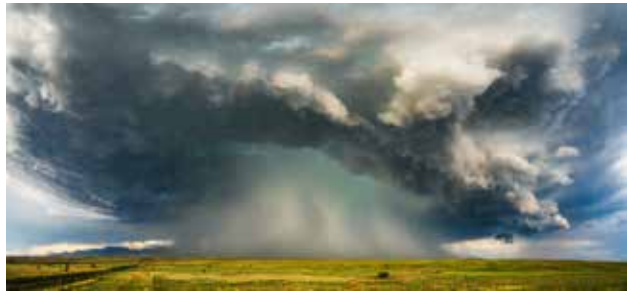
The Elgin Monster