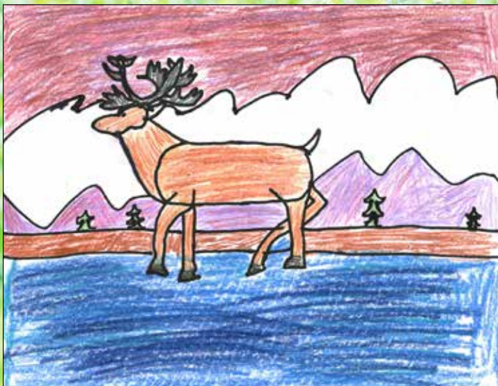
Dylan | age 13